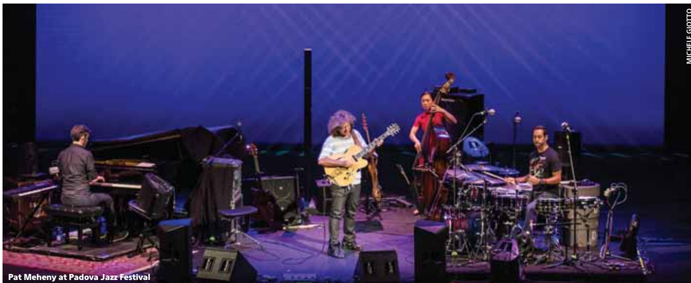
Pat Meheny at Padova Jazz Festival