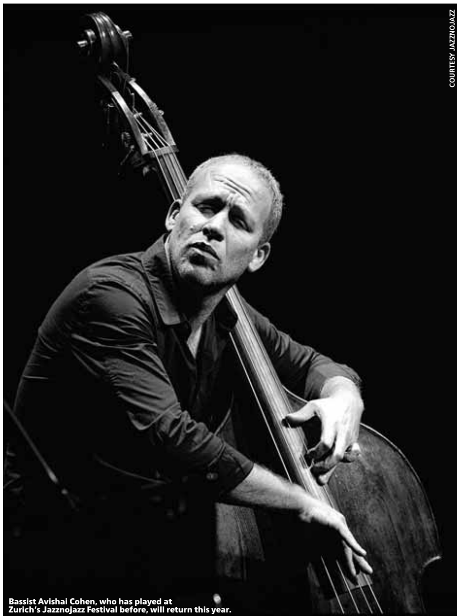
Bassist Avishai Cohen, who has played at Zurich's Jazznojazz Festival before, will return this year.