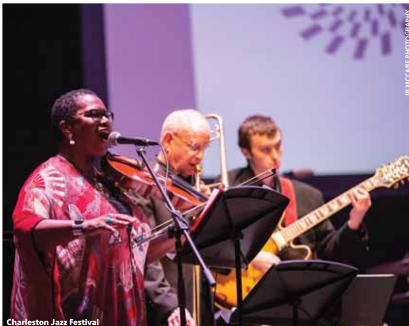
JB MCCABE PHOTOGRAPHY