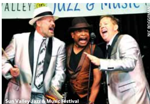
Sun Valley Jazz & Music Festival