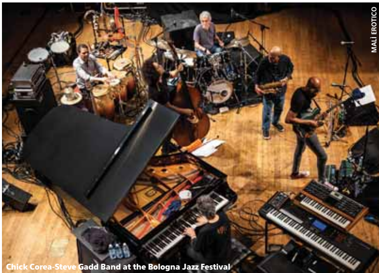
Chick Corea-Steve Gadd Band at the Bologna Jazz Festival