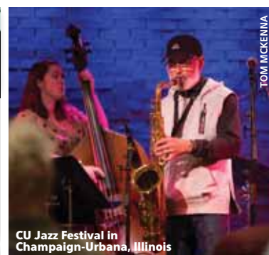
CU Jazz Festival in Champaign-Urbana, Illinois

collaborations and unexpected artistic collisions.