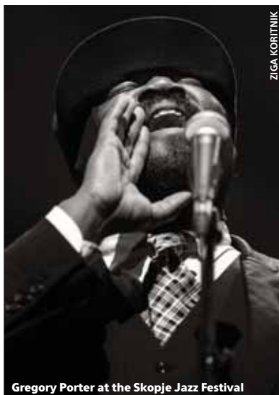
Gregory Porter at the Skopje Jazz Festival