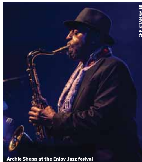
Archie Shepp at the Enjoy Jazz festival