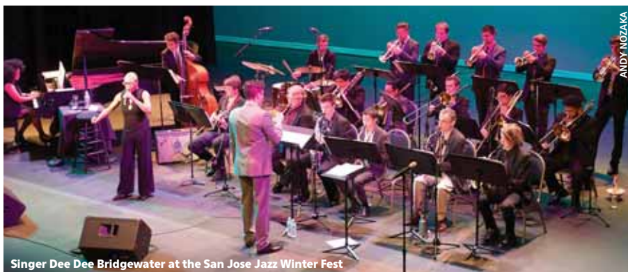
Singer Dee Dee Bridgewater at the San Jose Jazz Winter Fest