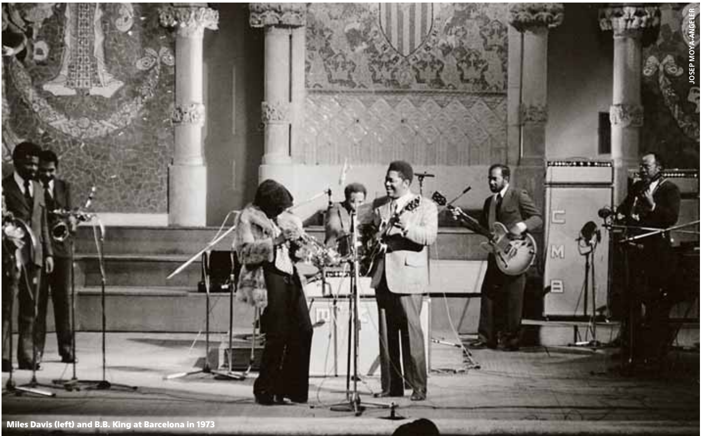
Miles Davis (left) and B.B. King at Barcelona in 1973