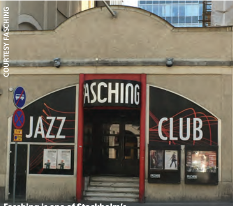
Fasching is one of Stockholm's most famous jazz venues.